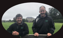
TOP RUGBY TUTORS