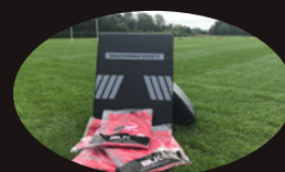
WORLD CLASS PARTNERS